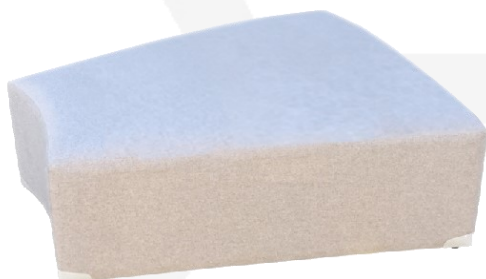
BOEJNR - BOEING JOINER