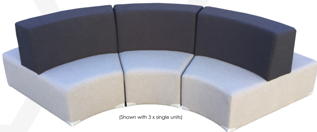
(Shown with 3 x single units)

*100% of the foams in this product are Good Environmental Choice Australia Certified